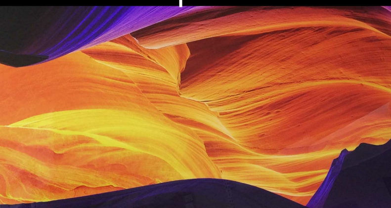
HD metallic photo paper